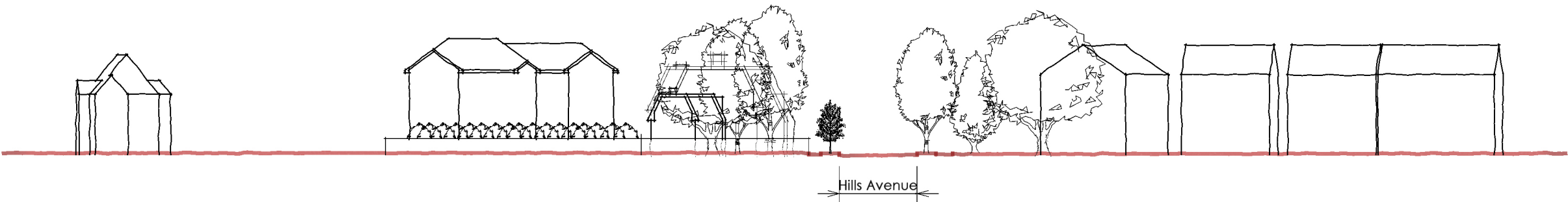
Street Elevation (Hills Road) (Scale - 1:500)

NOTES DO NOT SCALE THIS DRAWING THIS DRAWING IS COPYRIGHT GARY JOHNS ARCHITECTS ALL DIMENSIONS TO BE CONFIRMED ON SITE ANY INCONSISTENCIES TO BE REPORTED TO ARCHITECT IMMEDIATELY